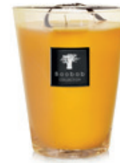
Zanzibar Spices Cinnamon - Turmeric