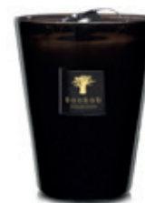
Encre de Chine Century Wood - Jasmine