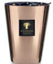
Cyprium Sandalwood - Pepper - Musk