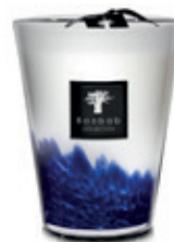
Feathers Touareg Mint - Jasmine - Musk