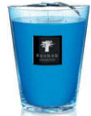
Nosy Iranja Sea Mist - Fig Leaves