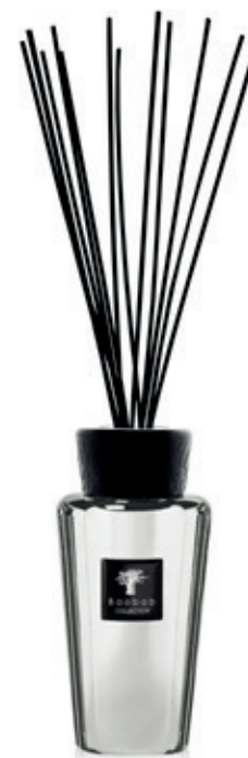
Lodge fragrance 500 ml