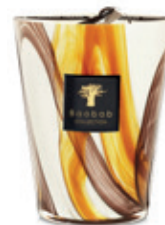
Spirit Cedar - Incense - Vanilla