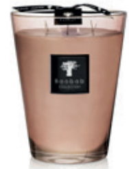
Serengeti Plains Bergamot - Rose