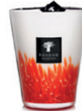
Feathers Maasai Patchouli - Rum Accord - Amber