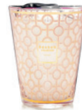
Women Magnolia - Rose - Musk