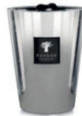
Platinum Amber - Grapefruit