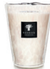
White Pearls White Musk - Jasmine