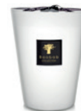
Pierre de Lune White Tea - Frosted Mint