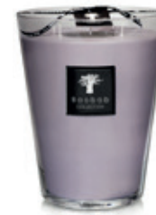
White Rhino Sandalwood - Vetiver