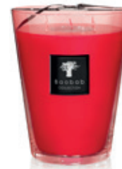
Maasai Spirit Ambergris - Pimento