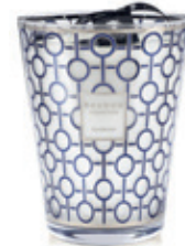
Gentlemen Rum Accord - Saffron - Labdanum

Baobab Collection supports BIG against breast cancer.