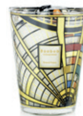
Grand Palais Coriander – Patchouli – Tonka