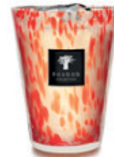
Coral Pearls Citrus - Jasmine - Cedar