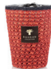
Foty Amber - Cinnamon - Cashmere wood