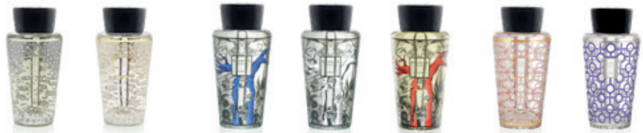
Pearls Black Pearls White Pearls