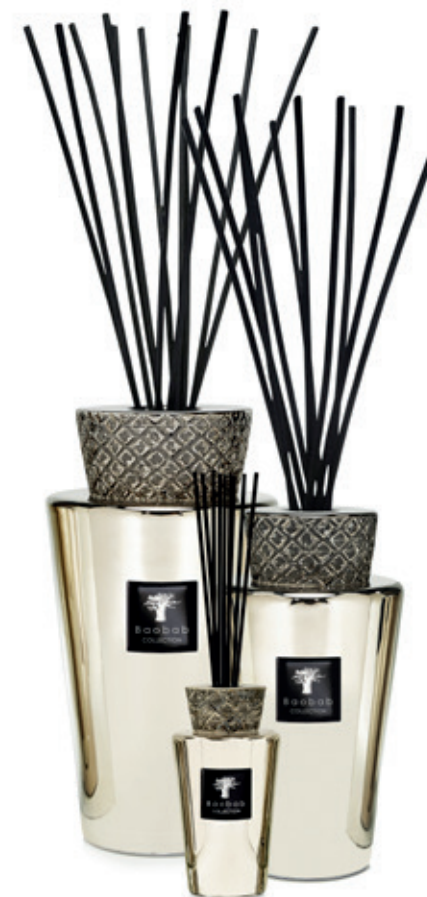
Totem Mini 250 ml - Medium 2 L - Large 5 L