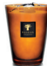
Cuir de Russie Veliver - Suede Leather