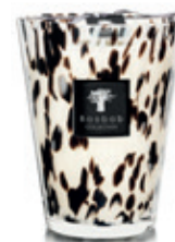
Black Pearls Black Rose - Ginger