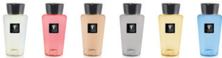
All Seasons Madagascar Vanilla Masaai Spirit Serengeti Plains White Rhino Zanzibar Spices Nosy Iranja