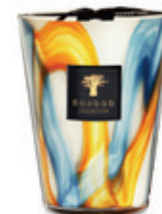
Holy Cyprus - Lily of the valley - Musk