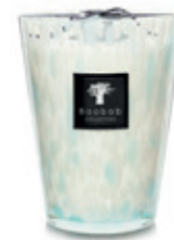
Sapphire Pearls Seaweed - Myrtle