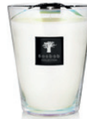
Madagascar Vanilla Frangipani - Vanilla