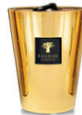
Aurum Precious Jasmine - Divine Musk