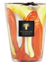
Bliss Citrus - Neroli - Vetiver