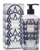
Lotion Corps & Mains Body & Hand Lotion