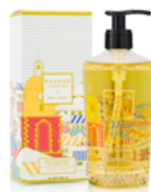
Gel Lavant Mains Hand Wash Gel