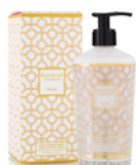
Lotion Corps & Mains Body & Hand Lotion