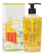
Gel douche Shower Gel