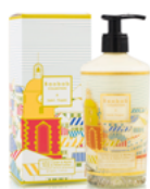
Lotion Corps & Mains Body & Hand Lotion