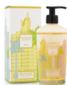
Lotion Corps & Mains Body & Hand Lotion