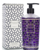
Gel douche Shower Gel