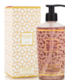
Gel Lavant Mains Hand Wash Gel