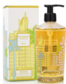
Gel douche Shower Gel