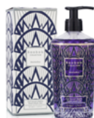
Gel Lavant Mains Hand Wash Gel