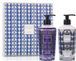
Gel Lavant Mains | Lotion Corps & Mains Hand Wash Gel | Body & Hand Lotion