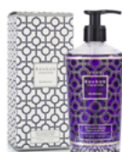
Gel Lavant Mains Hand Wash Gel