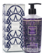
Gel douche Shower Gel