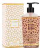
Gel douche Shower Gel