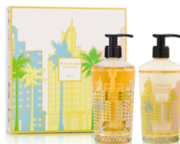
Gel Lavant Mains | Lotion Corps & Mains Hand Wash Gel | Body & Hand Lotion