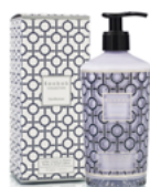
Lotion Corps & Mains Body & Hand Lotion