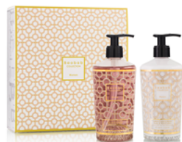
Gel Lavant Mains | Lotion Corps & Mains Hand Wash Gel | Body & Hand Lotion