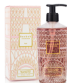
Gel Lavant Mains Hand Wash Gel