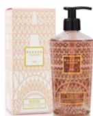
Gel douche Shower Gel