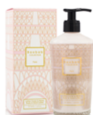
Lotion Corps & Mains Body & Hand Lotion