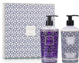
Gel Lavant Mains | Lotion Corps & Mains Hand Wash Gel | Body & Hand Lotion