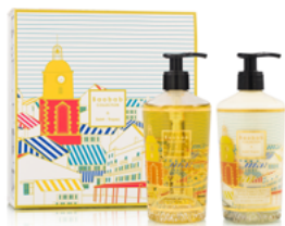
Gel douche | Lotion Corps & Mains Shower Gel | Body & Hand Lotion