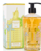
Gel Lavant Mains Hand Wash Gel