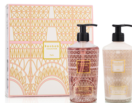
Gel Lavant Mains | Lotion Corps & Mains Hand Wash Gel | Body & Hand Lotion