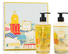
Gel Lavant Mains | Lotion Corps & Mains Hand Wash Gel | Body & Hand Lotion