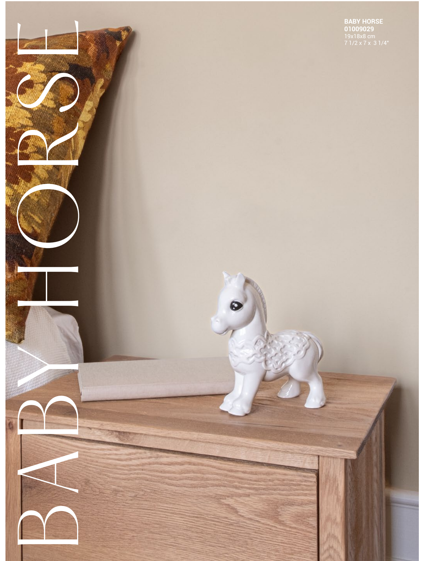
BABY HORSE 01009029 19x18x8 cm 7 1/2 x 7 x 3 1/4"

The Baby Animals collection invites us to explore an ancient tradition through a contemporary lens.