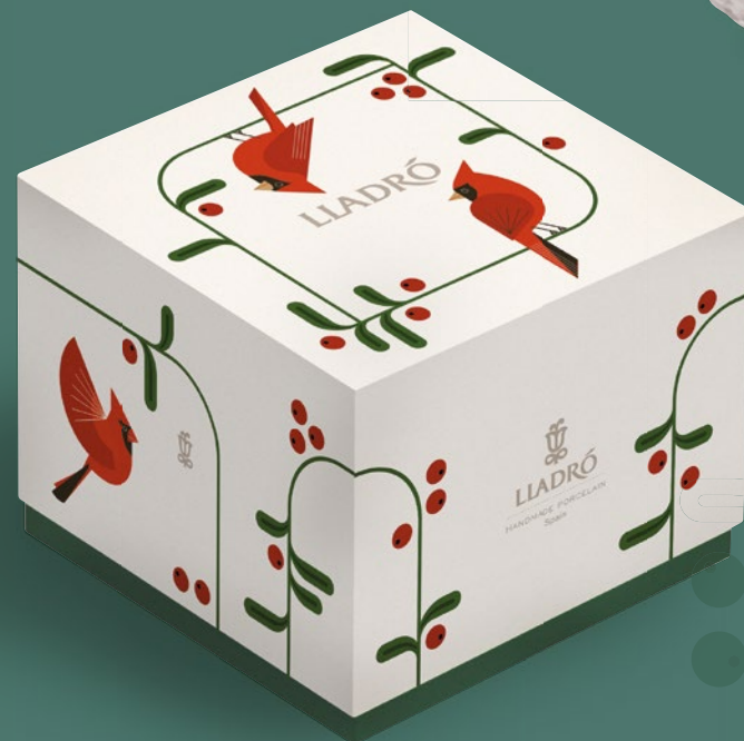
2026 CHRISTMAS BELL 01018488 9 x 8 x 8 cm 3 1/2 x 3 1/4 x 3 1/4" Limited Edition of 5,000 units