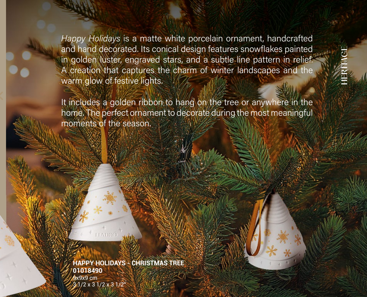
HAPPY HOLIDAYS - CHRISTMAS TREE 01018490 9x9x9 cm 3 1/2 x 3 1/2 x 3 1/2"

It includes a golden ribbon to hang on the tree or anywhere in the home. The perfect ornament to decorate during the most meaningful moments of the season.