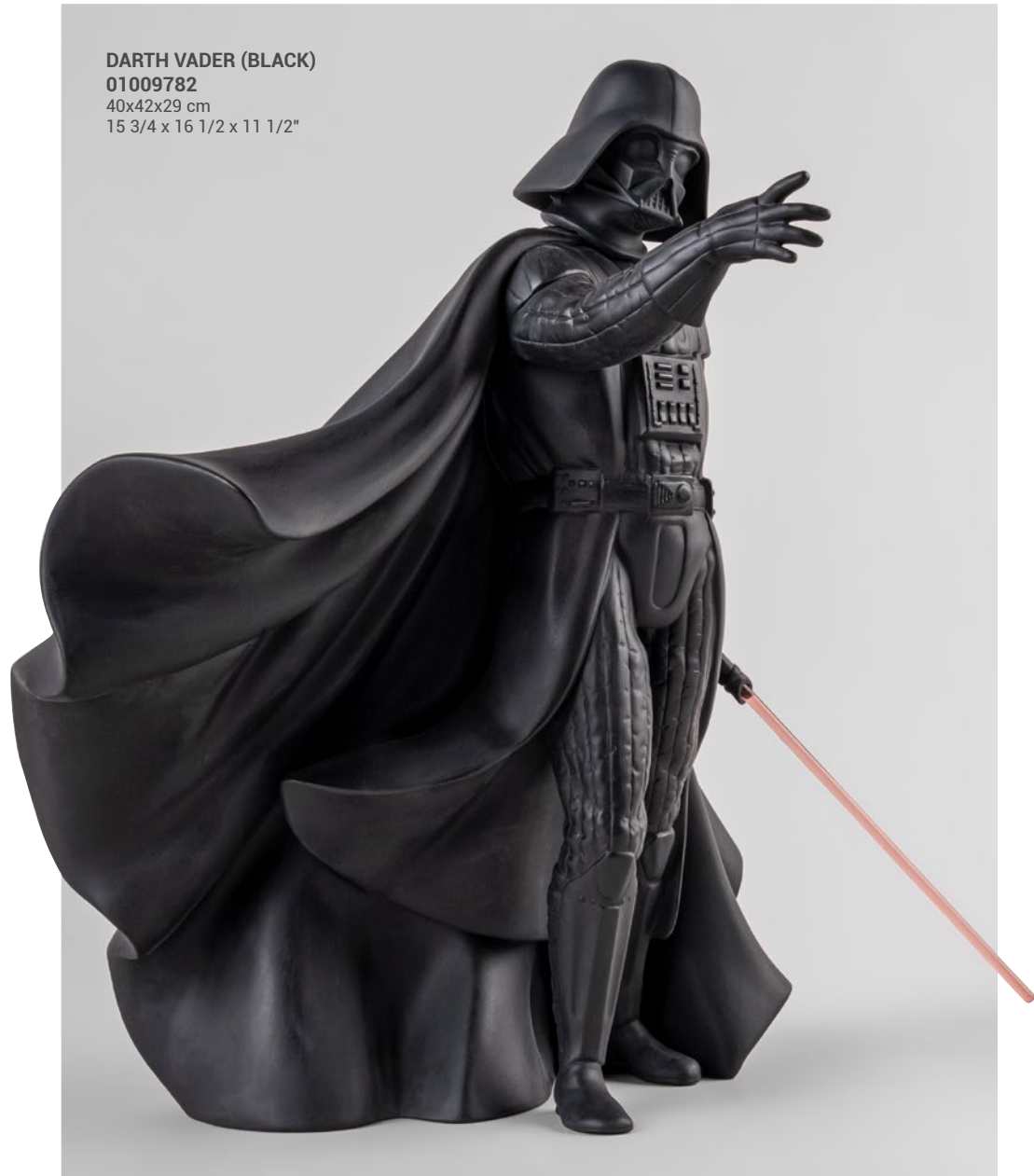
DARTH VADER (BLACK) 01009782 40x42x29 cm 15 3/4 x 16 1/2 x 11 1/2"

Inspired by the film saga that has influenced generations, Darth Vader™ embodies the dark side, the tension between power and redemption, and the magnetic presence of a character who transcends the screen. A must-have creation for Star Wars™ fans.