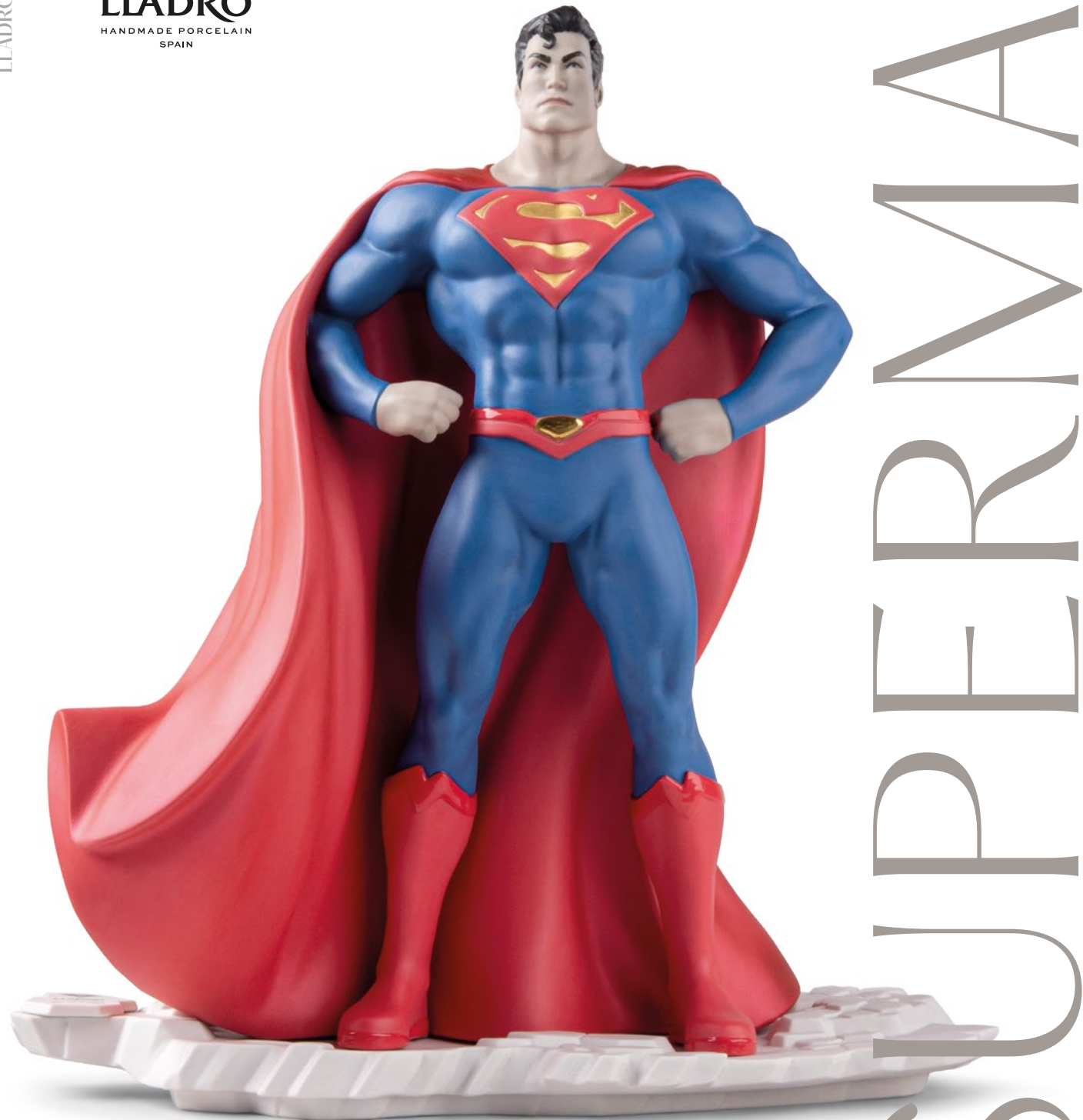
SUPERMAN 1009777 46x42x27 cm 18 x 16 1/2 x 10 3/4" Limited Edition of 500 units