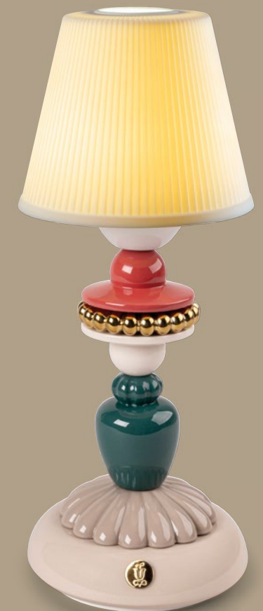
FIREFLY LAMP - MAGIC HOLIDAYS 01024466 30x12x12 cm 11 3/4 x 4 3/4 x 4 3/4"