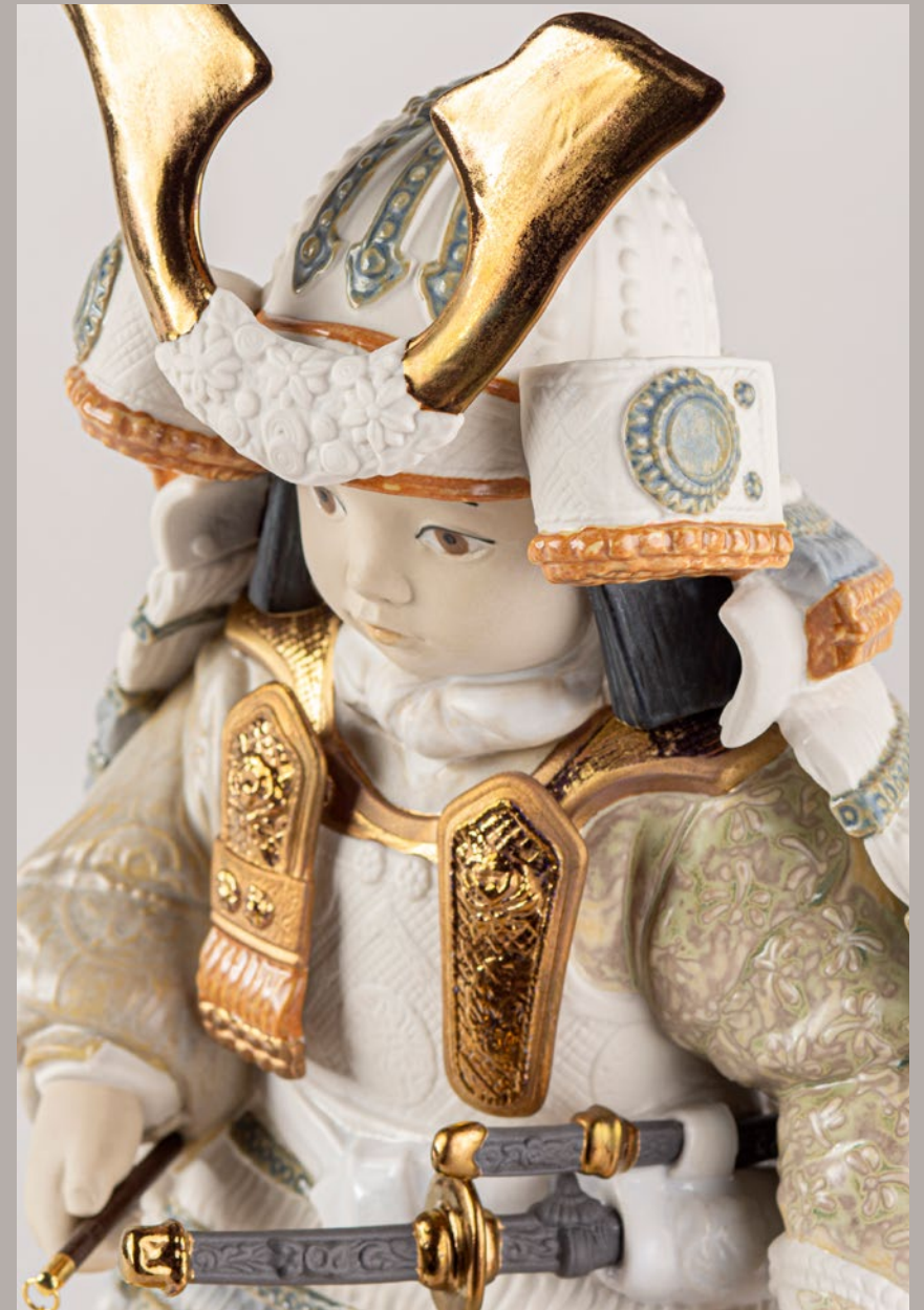
WARRIOR BOY (COPPER) 01013056 34x21x19 cm 13 1/2 x 8 1/4 x 7 1/2" Limited Edition of 500 units

Warrior Boy (Copper) is inspired by a Japanese tradition celebrated every year on May 5th, known as Children's Day. On this occasion, homes are decorated with warrior representations to wish children health and strength. These displays express the hope that children will grow up with courage and determination.