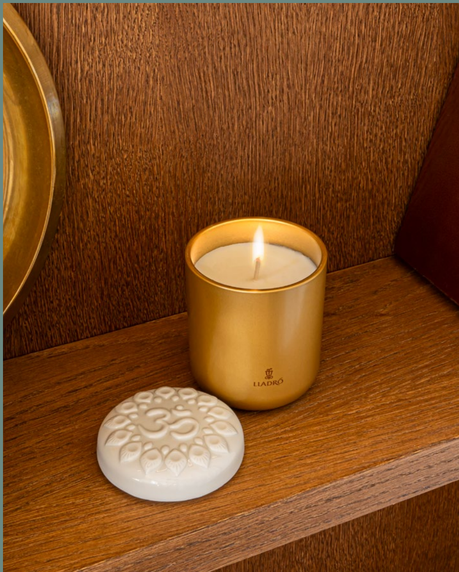
OM CANDLE - GARDENS OF VALENCIA 01040314 12x8x8 cm 4 3/4 x 3 1/4 x 3 1/4"

Om , the sacred syllable in Hinduism and Buddhism, represents union with the supreme, the origin of sound, and the balance between body, mind, and spirit. This symbol is hand-engraved on the porcelain lid of this scented candle.