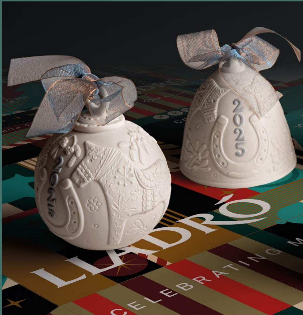
CHRISTMAS BALL 2025 01018486 10 x 9 x 9 cm Limited Edition of 4,000 units