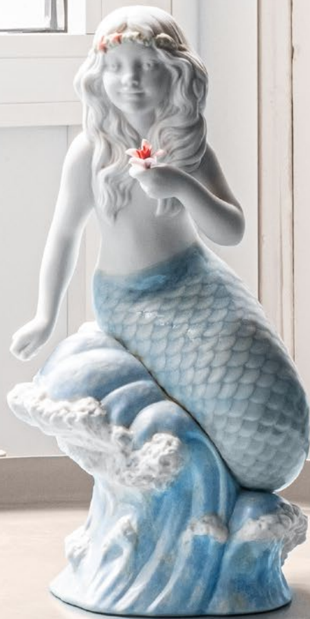
OCEAN'S LITTLE MERMAID 01008998 23 x 13 x 13 cm 9 x 5 x 5"