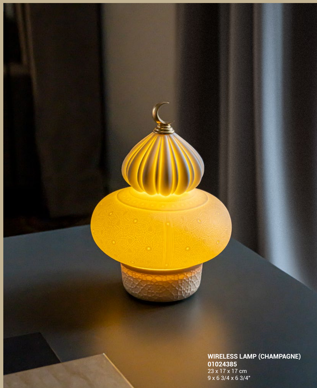
WIRELESS LAMP (CHAMPAGNE) 01024385 23 x 17 x 17 cm 9 x 6 3/4 x 6 3/4"

The collection includes a cordless lamp, an incense diffuser, a box with four plates, and a candleholder, all adorned with a highly detailed latticework pattern engraved by hand by our ornamentation team.