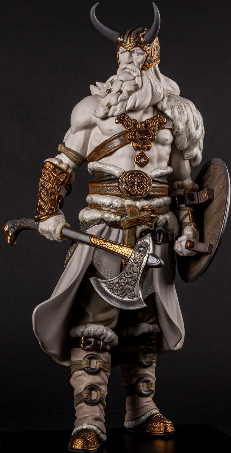
ODIN 01009028 70 x 34 x 27 cm 27 1/2 x 13 1/2 x 10 3/4"