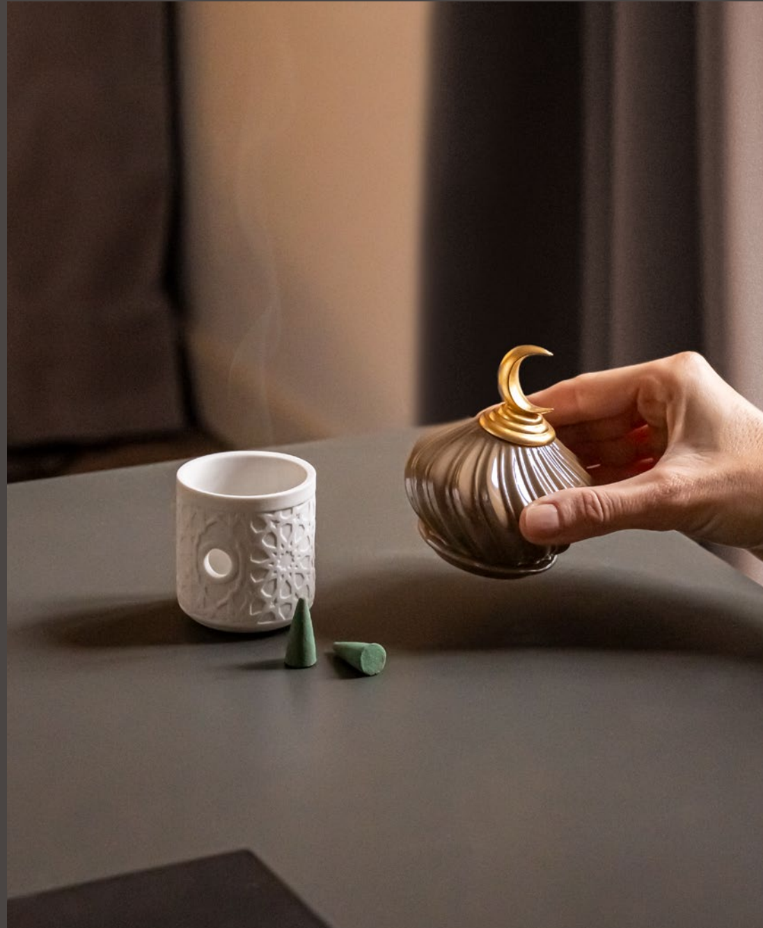
MAJESTIC NIGHTS INCENSE DIFFUSER (BROWN) 01040312 14 x 8 x 8 cm 5 1/2 x 3 1/4 x 3 1/4"

The incense diffuser is decorated with a light brown enamel and includes three incense cones.