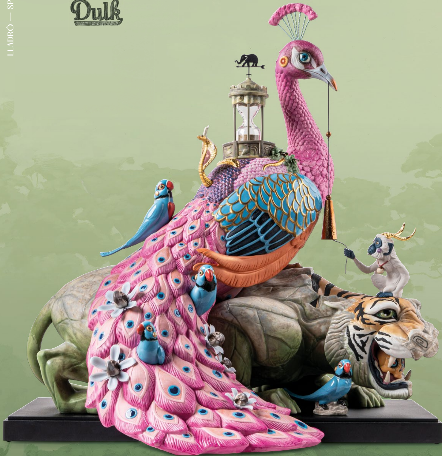
EPHEMERAL TREASURES 01002037 60 x 56 x 42 cm 23 1/2 x 22 x 16 1/2" Limited Edition of 200 units