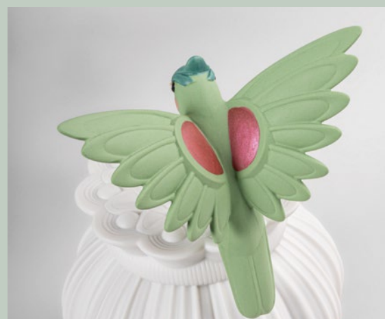
UTOPICAL WIRELESS LAMP 01024387 22 x 15 x 15 cm 8 3/4 x 6 x 6"